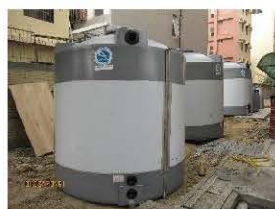
Industrial Pure Water tank