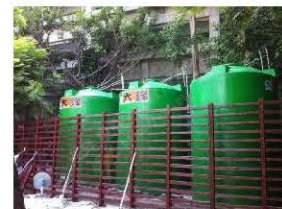
Antibacterial storage tank