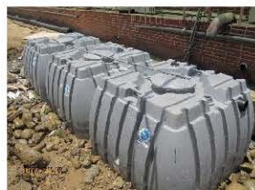
Rainwater Recycling tank